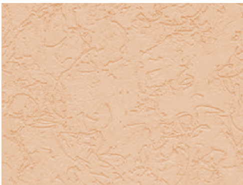
ACRY-LINE 1 MM circular trowel application